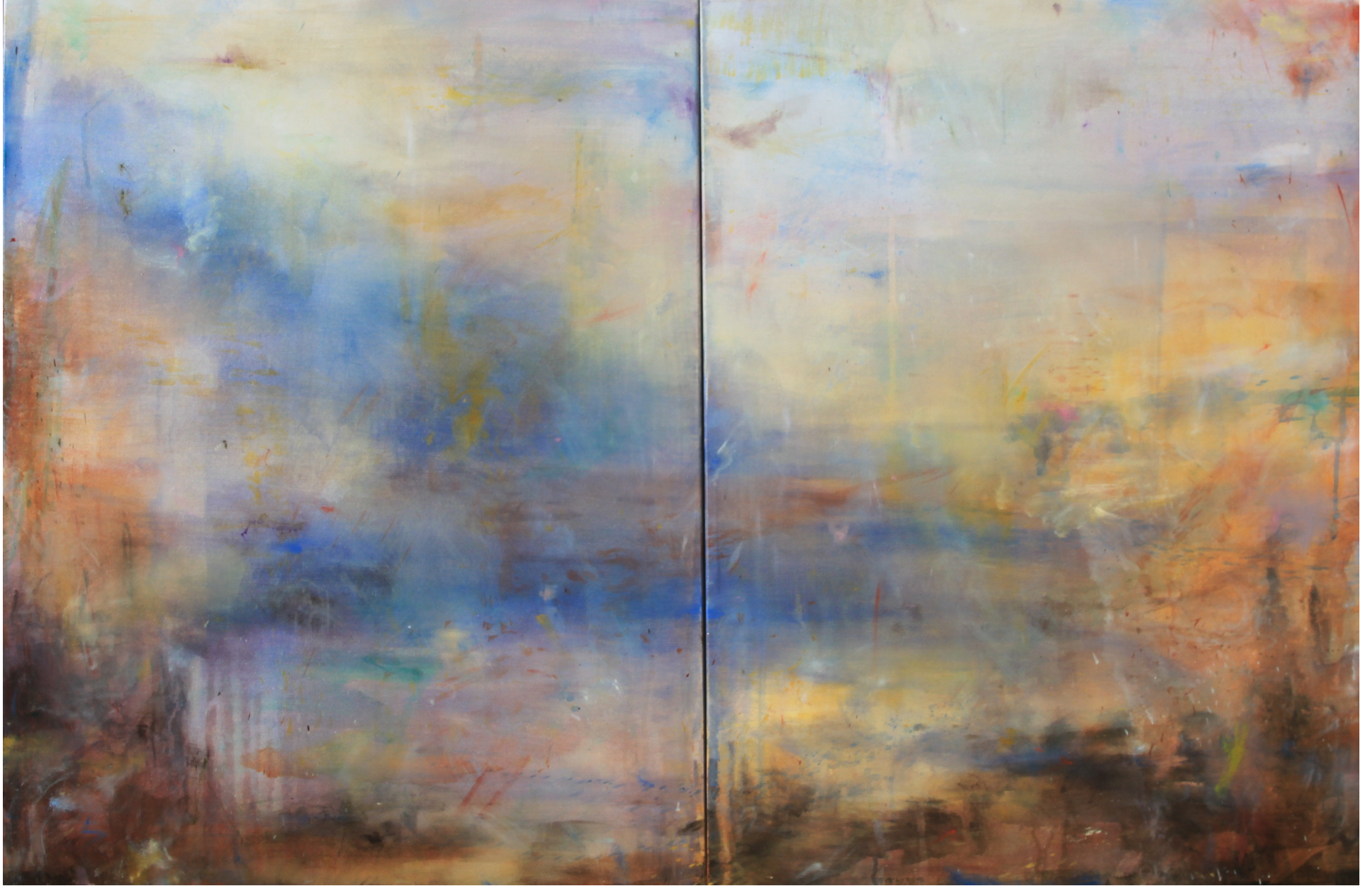
English Landscape, 80 x 120 cm, acrylic & oil on canvas