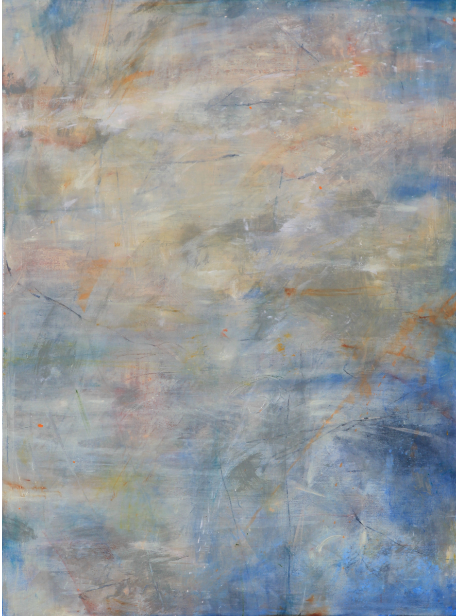
Impression I, 72.5 x 54 cm, acrylic & oil on canvas