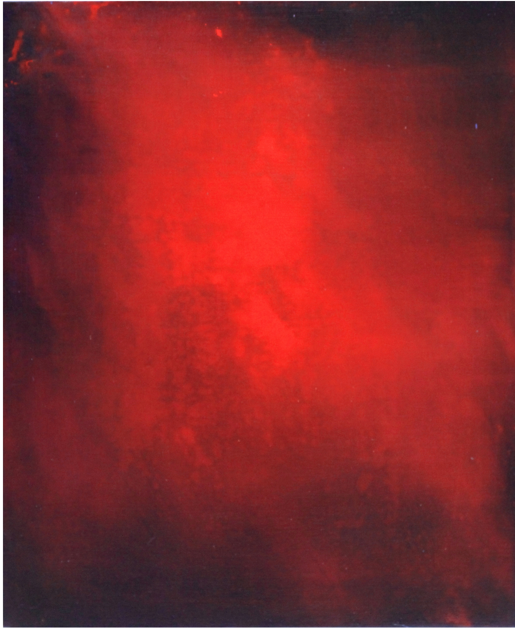
Red Universe I, 46 x 38 cm, acrylic & oil on canvas