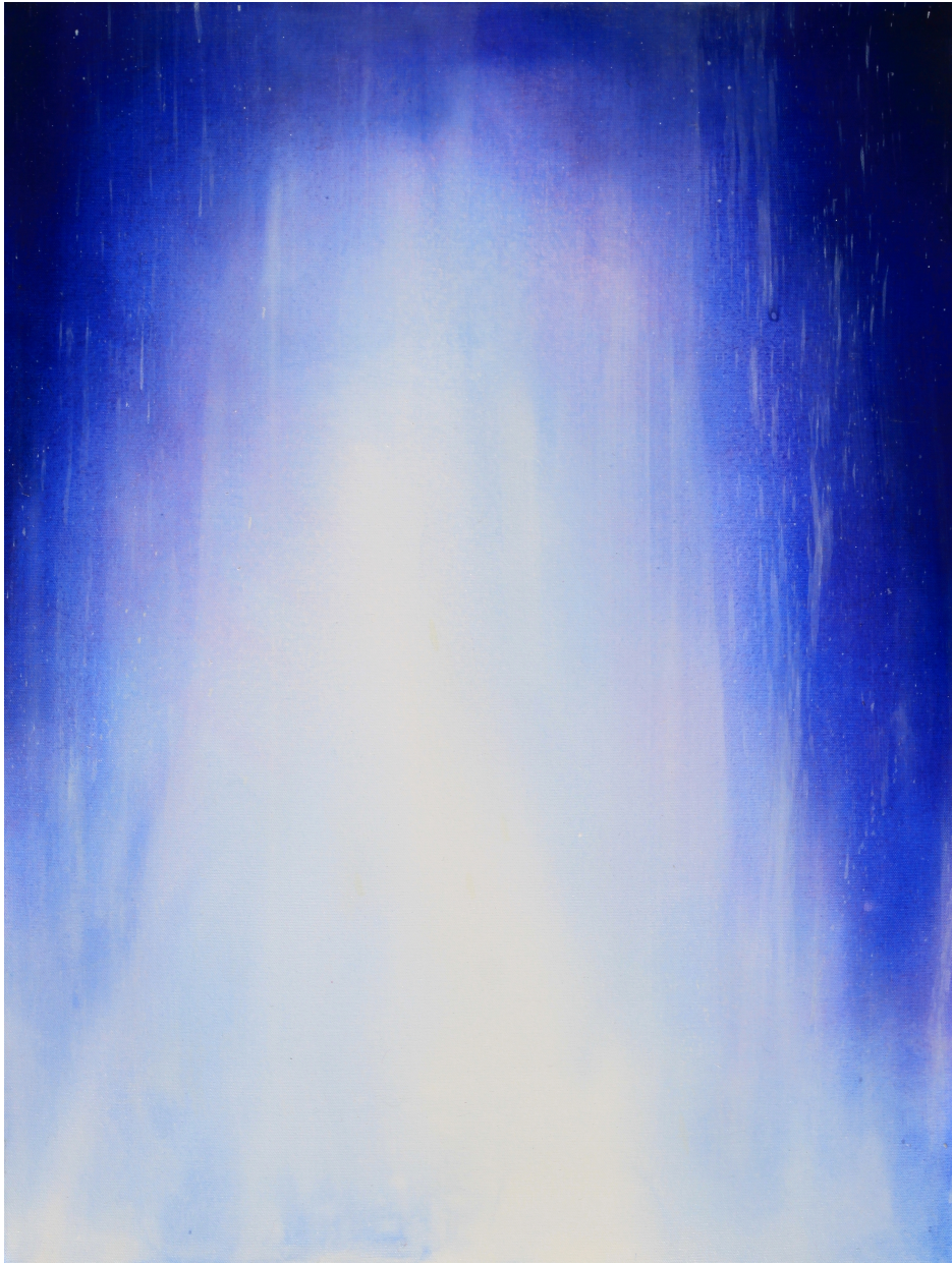
Night Fountain II, 80 x 60 cm, acrylic & oil on canvas