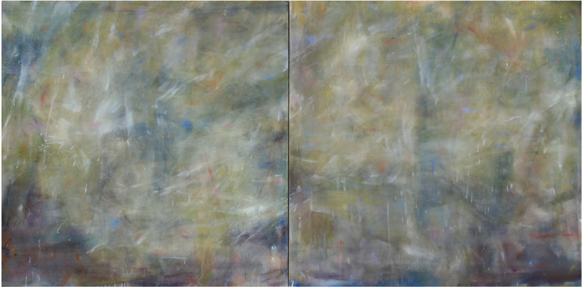
Opalescent I & II, 100 x 200 cm, acrylic and oil on canvas