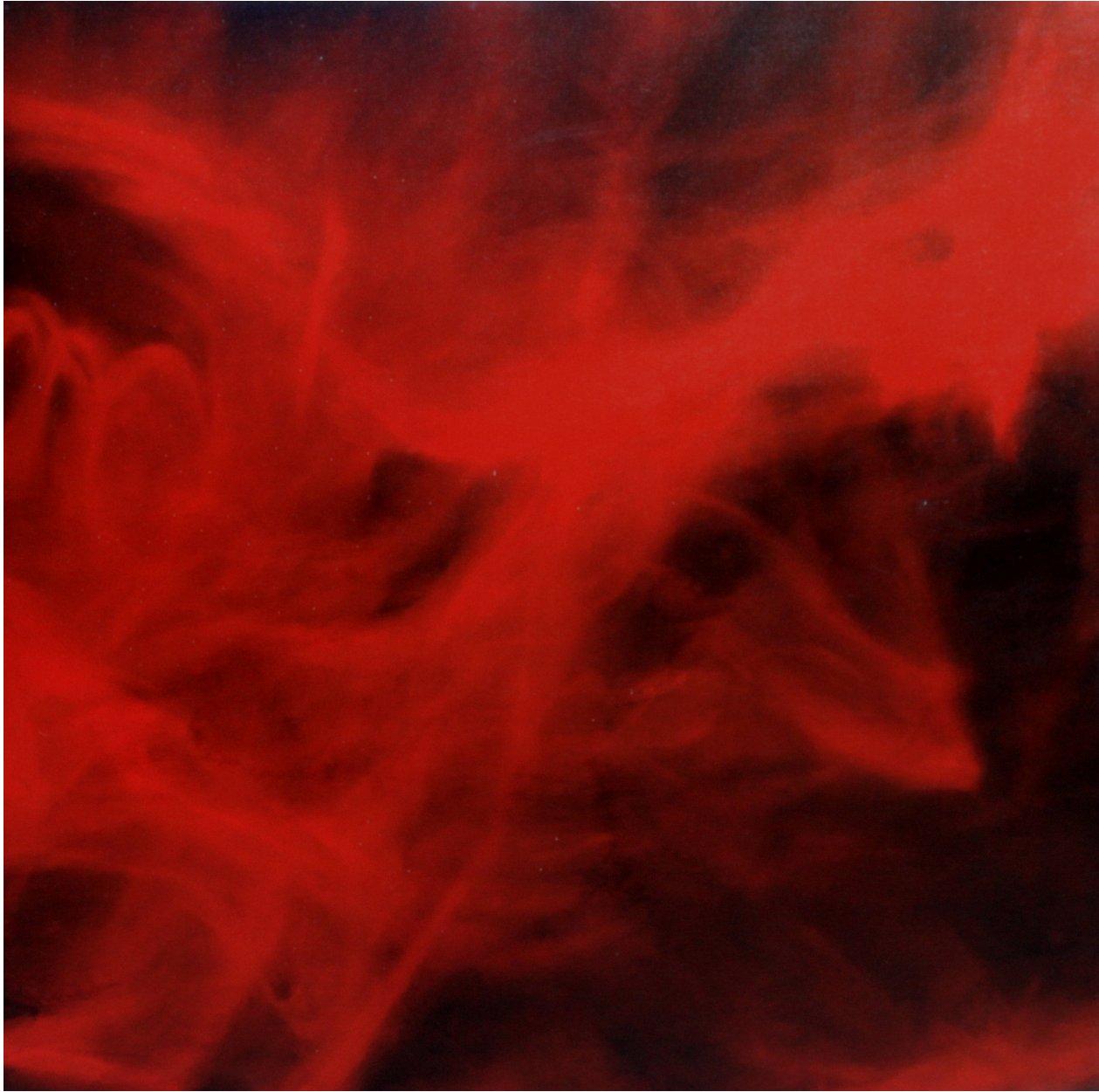
Red Abstract, 100 x 100 cm, oil on canvas