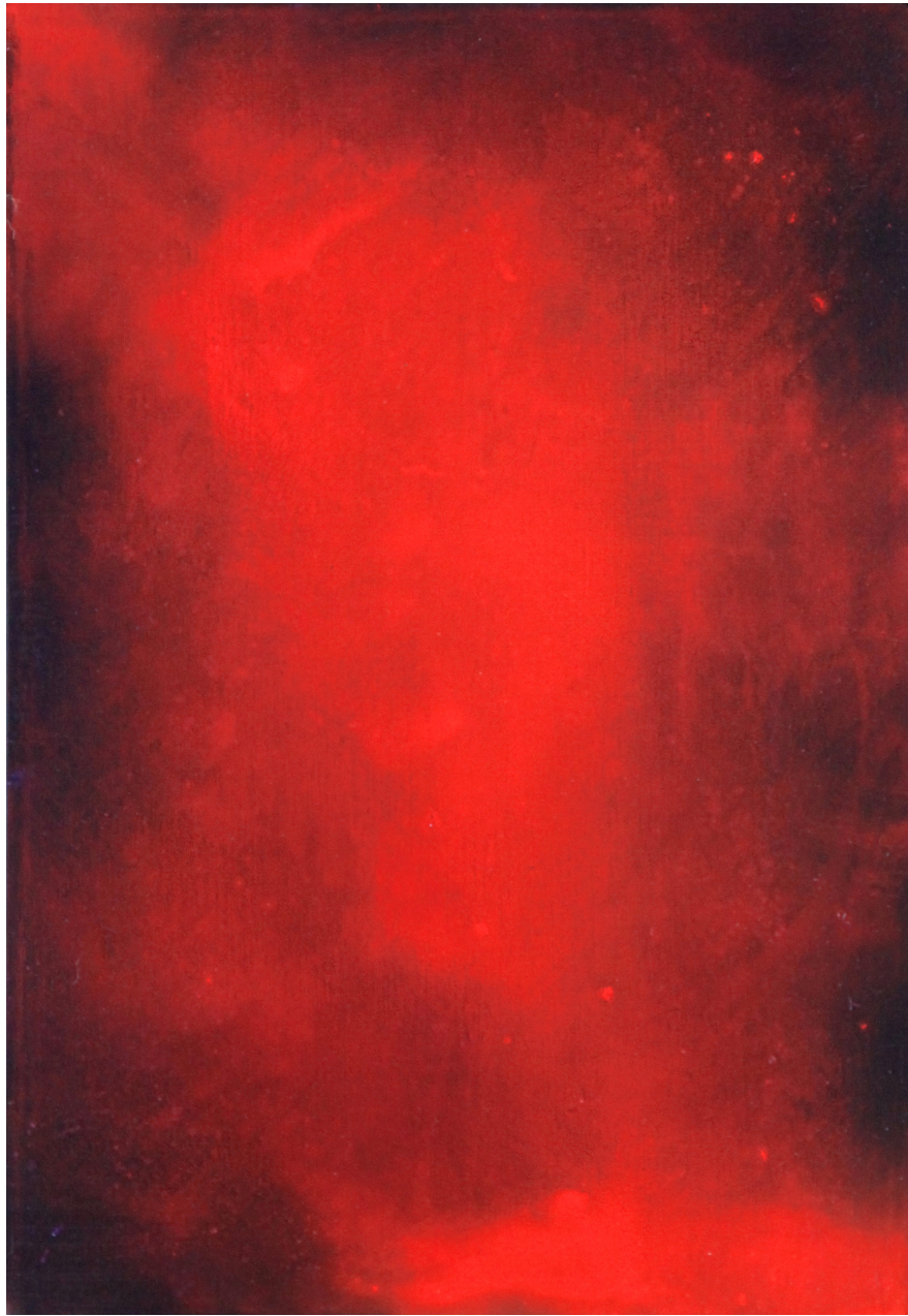
Red Universe II, 55 x 38 cm, acrylic & oil on canvas