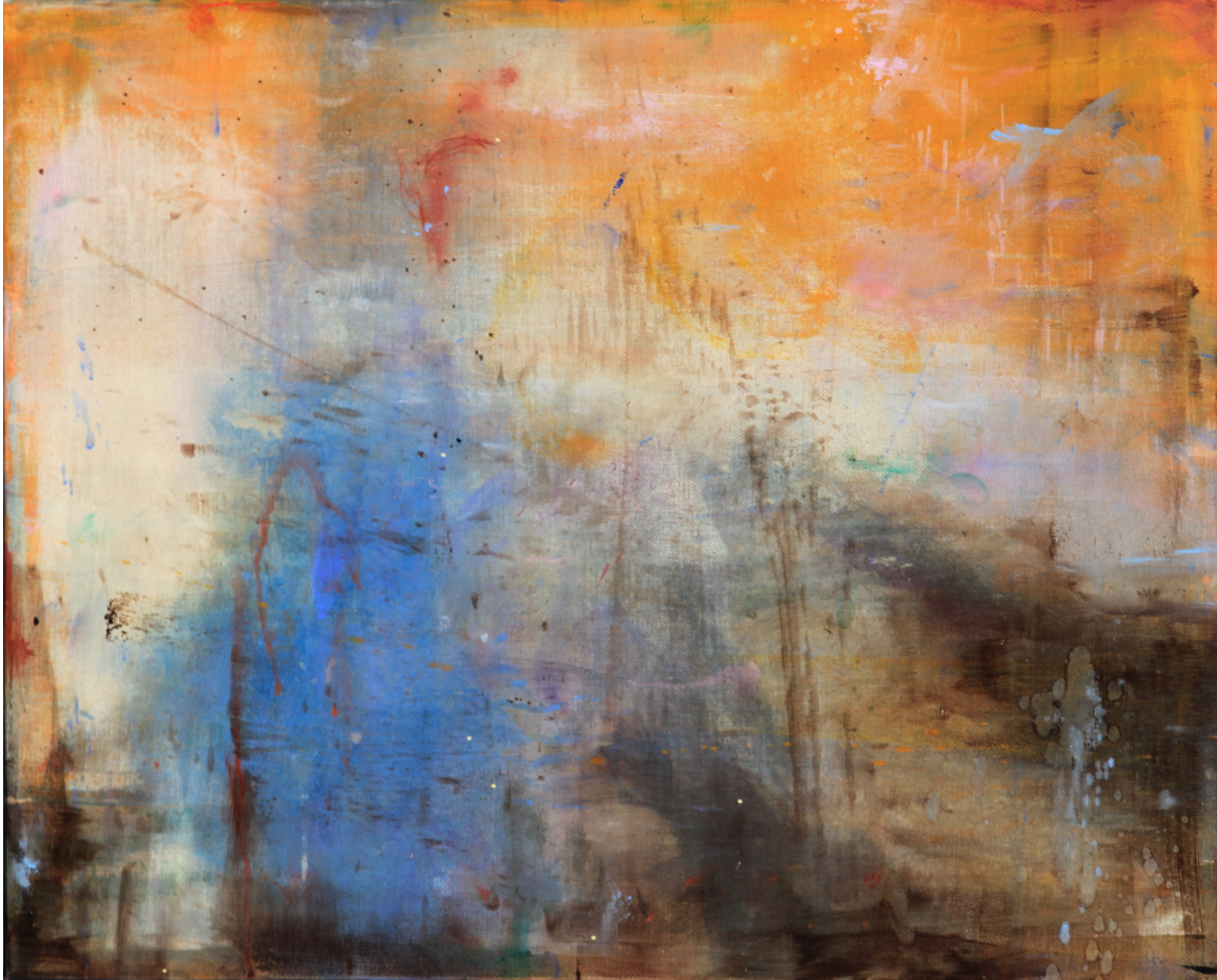
Languedoc, 40 x 50 cm, acrylic & oil on canvas