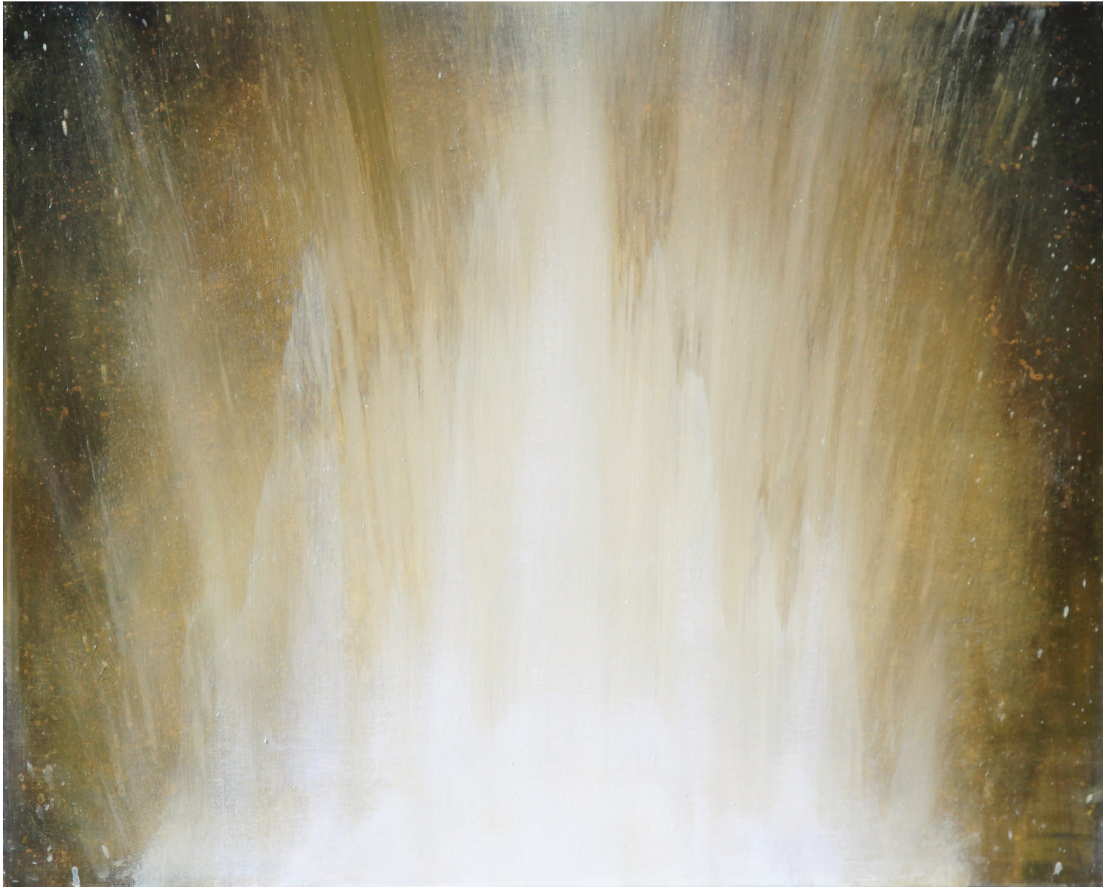
Night Fountain I, 40 x 50 cm, acrylic & oil on canvas