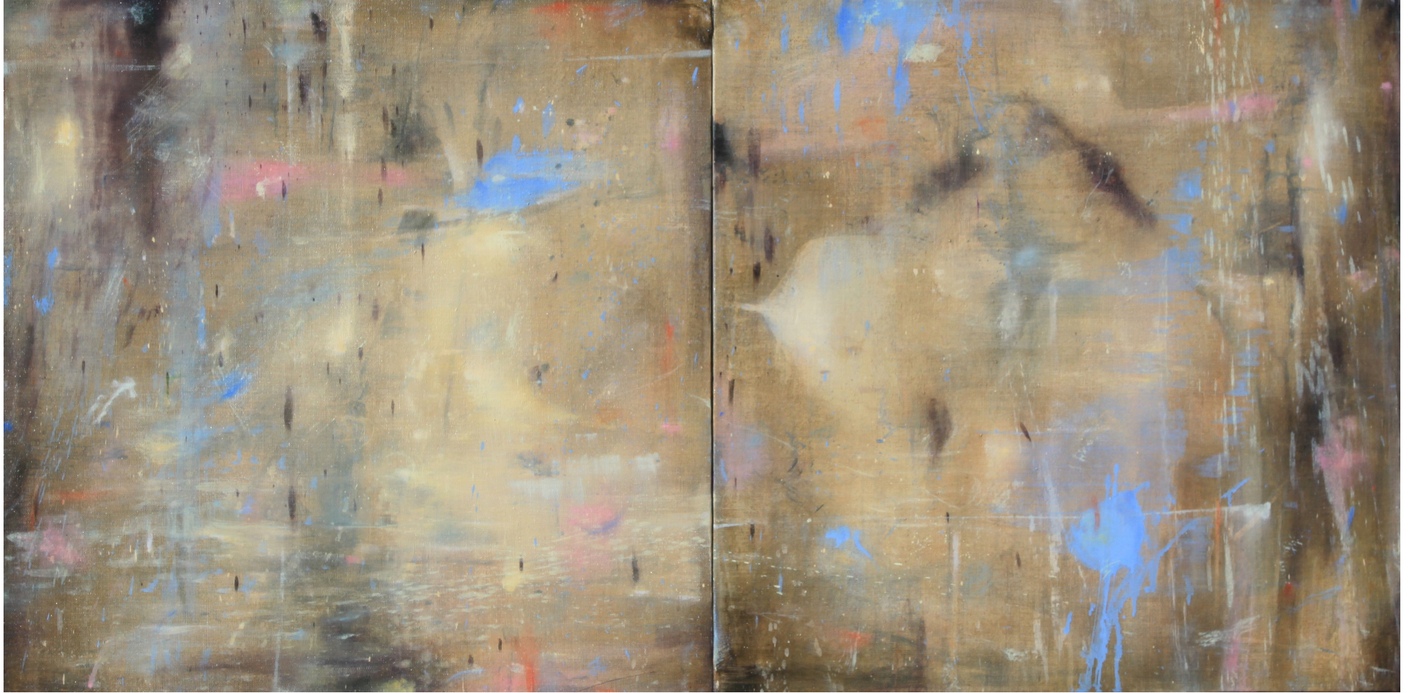
Fête, 50 x 100 cm, acrylic & oil on canvas