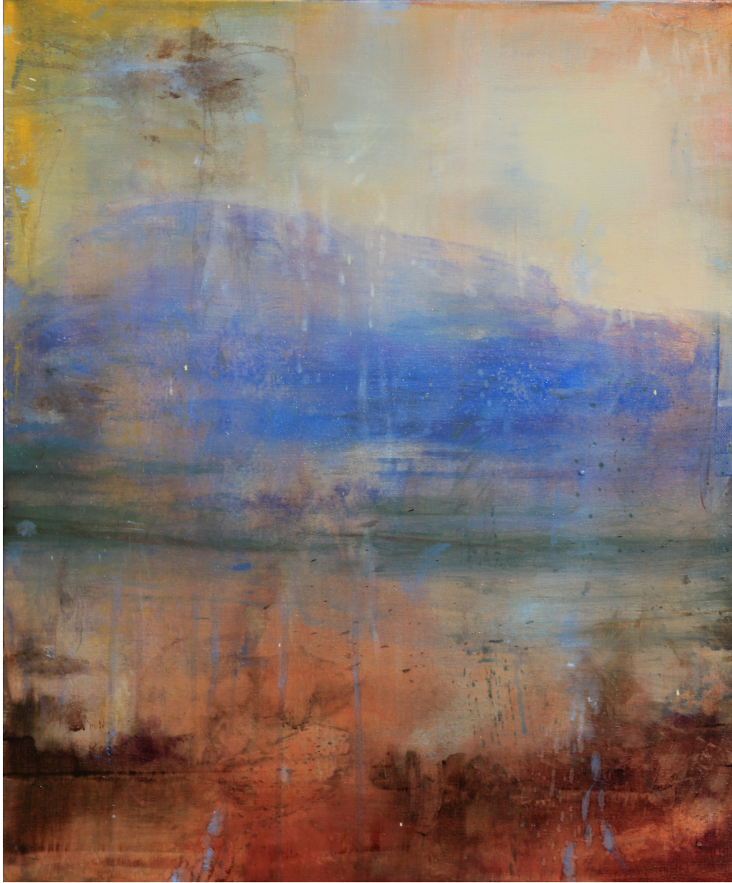
Montagne d'Alaric, 60 x 50 cm, acrylic & oil on canvas