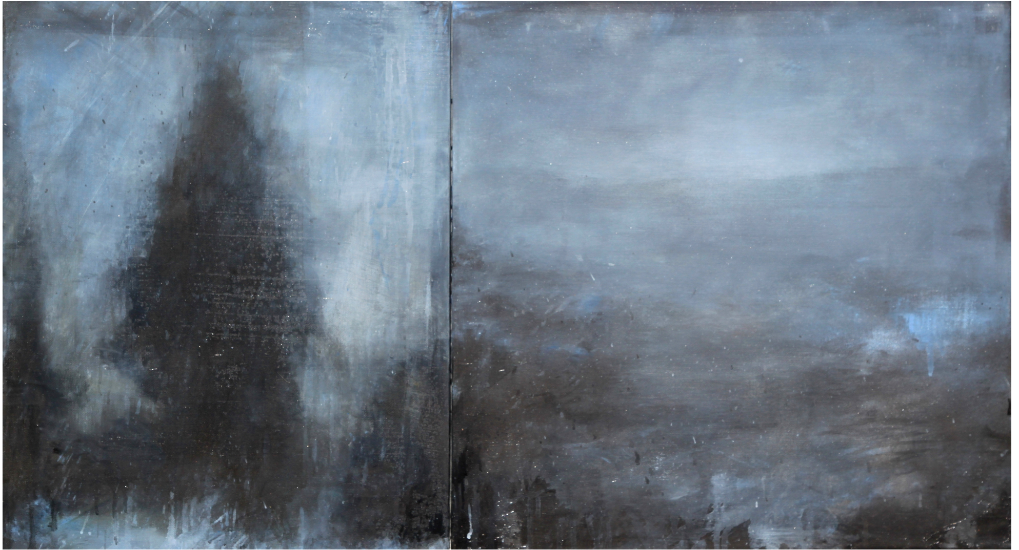
Blue Grey Landscapes I & II, 50 x 40 cm & 50 x 50 cm, acrylic and oil on canvas