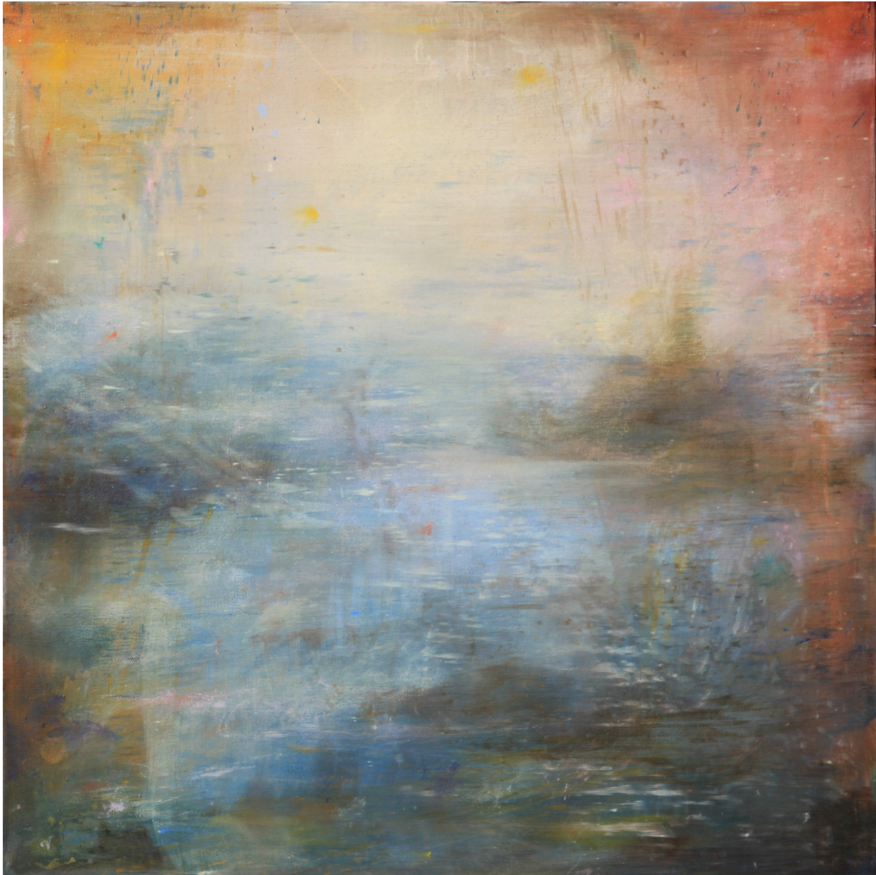
Minervois, 50 x 50 cm, acrylic & oil on canvas