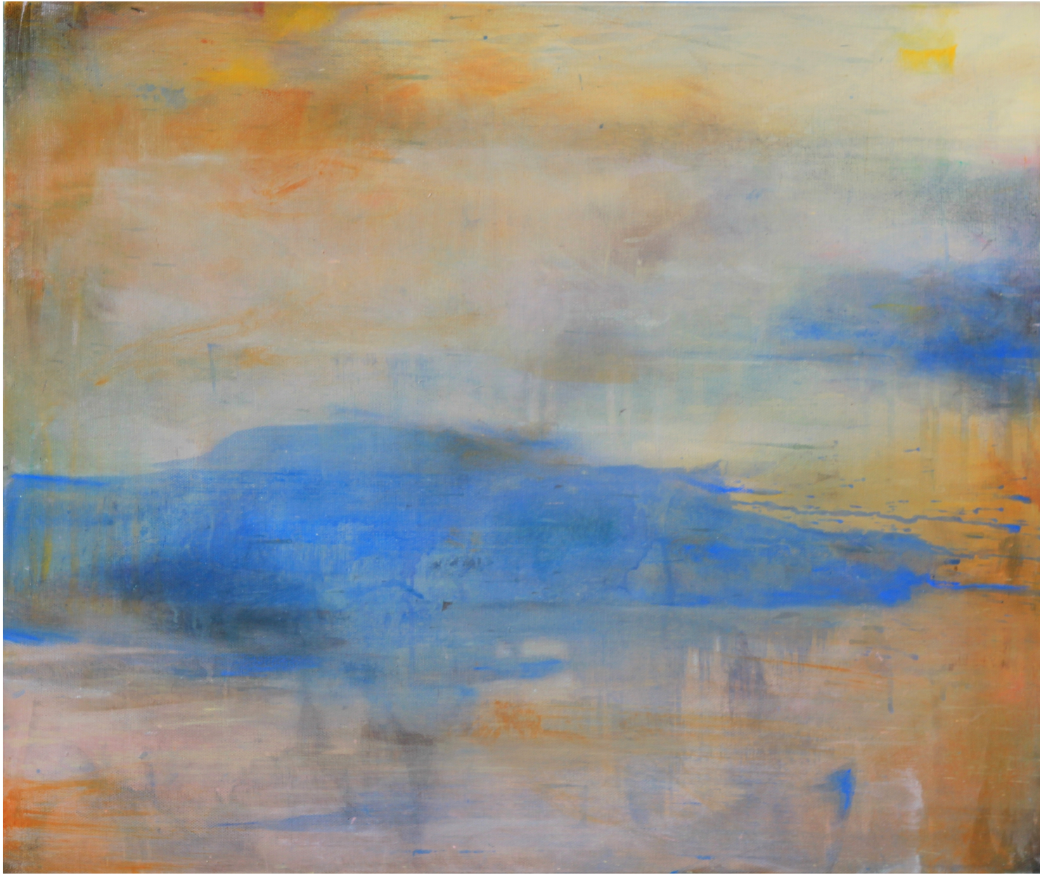
Corbiere, 50 x 60 cm, acrylic & oil on canvas