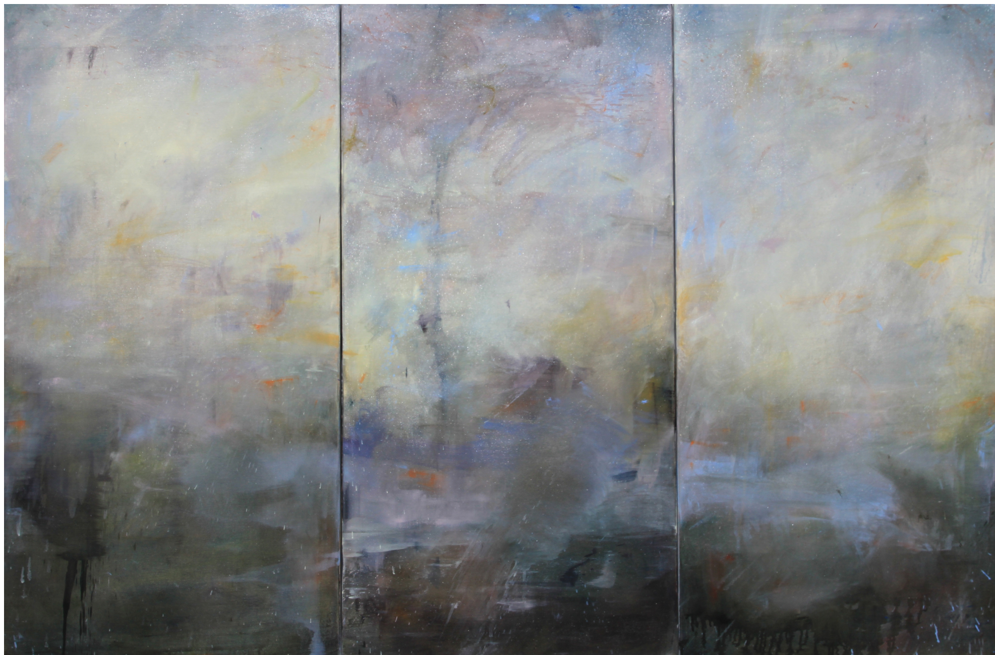
French Landscape, 100 x 150 cm, acrylic & oil on canvas