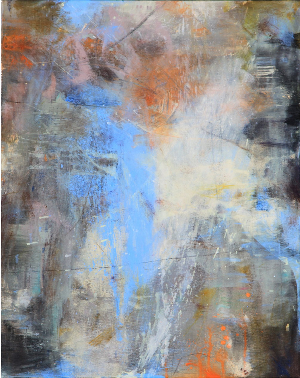
Amalgamare, 50 x 40 cm, acrylic & oil on canvas