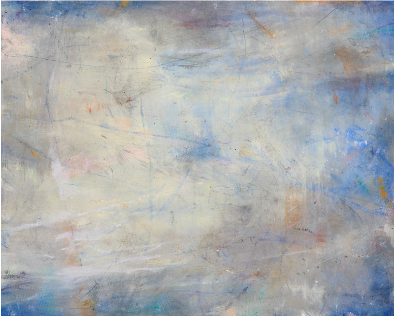
Impression II, 40 x 50 cm, acrylic & oil on canvas