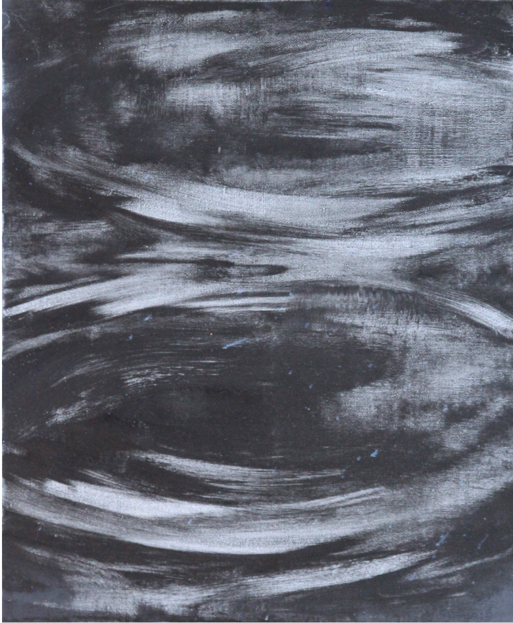
Marriage, 46 x 38 cm, graphite powder & alkyd medium on canvas