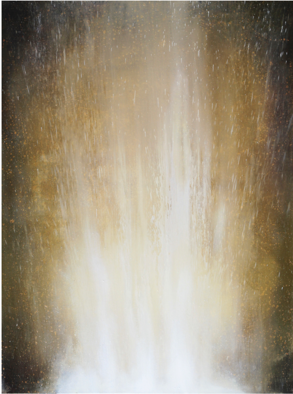
Night Fountain III, 80 x 60 cm, acrylic and oil on canvas