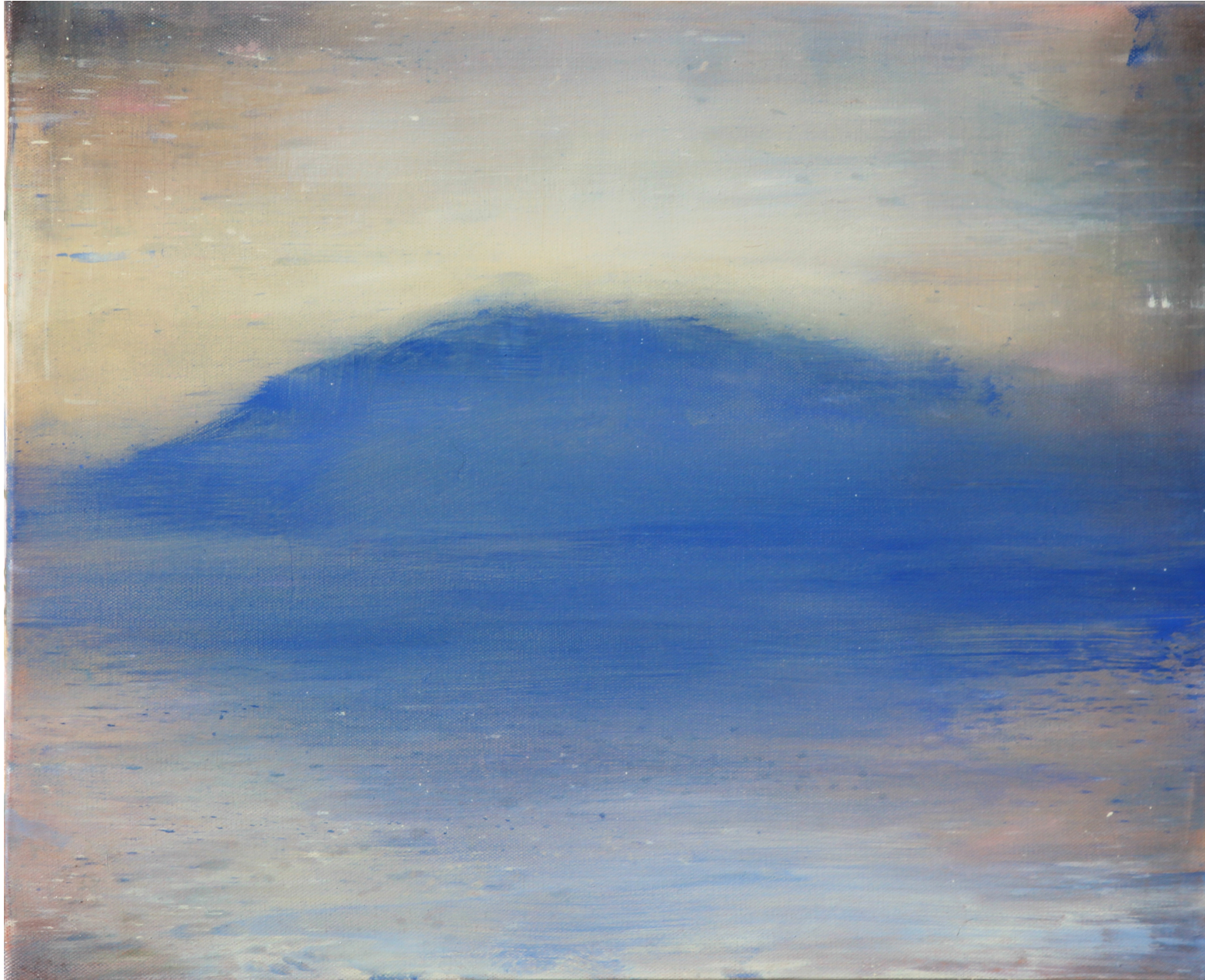
Blue Reflection, 40 x 50 cm, acrylic & oil on canvas