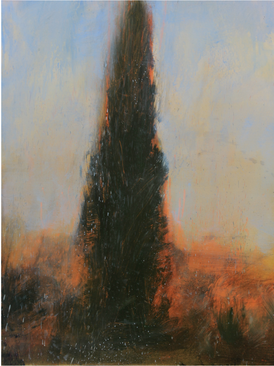
Cypress, 80 x 60 cm, acrylic & oil on canvas